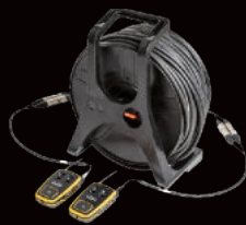
Bobine PRO 461